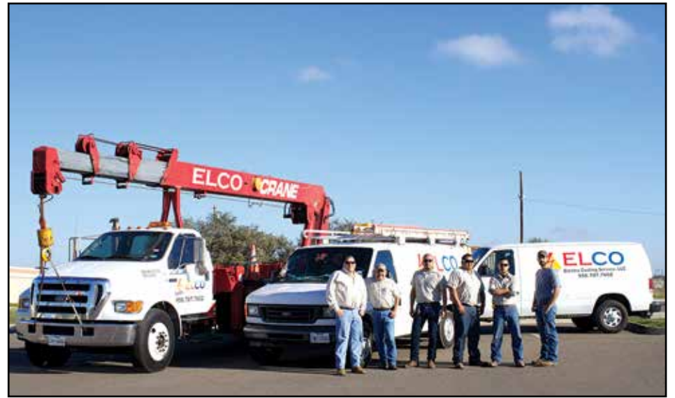
Some of the crew at ELCO gather for a picture under a blue, Rio Grande Valley sky.